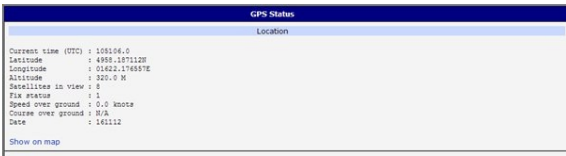
Figure 1: GPS Status – Location